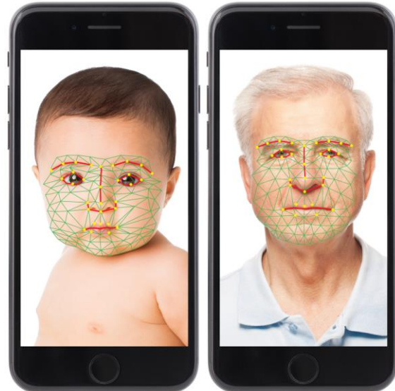
PainChek® artificial intelligence assesses facial micro-expressions that are indicative of the presence of pain.

To find out more, visit www.painchek.com